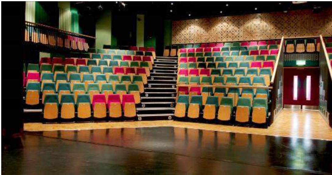
Our state of the art theatre

Brampton Manor Academy Roman Road, London, E6 3SQ