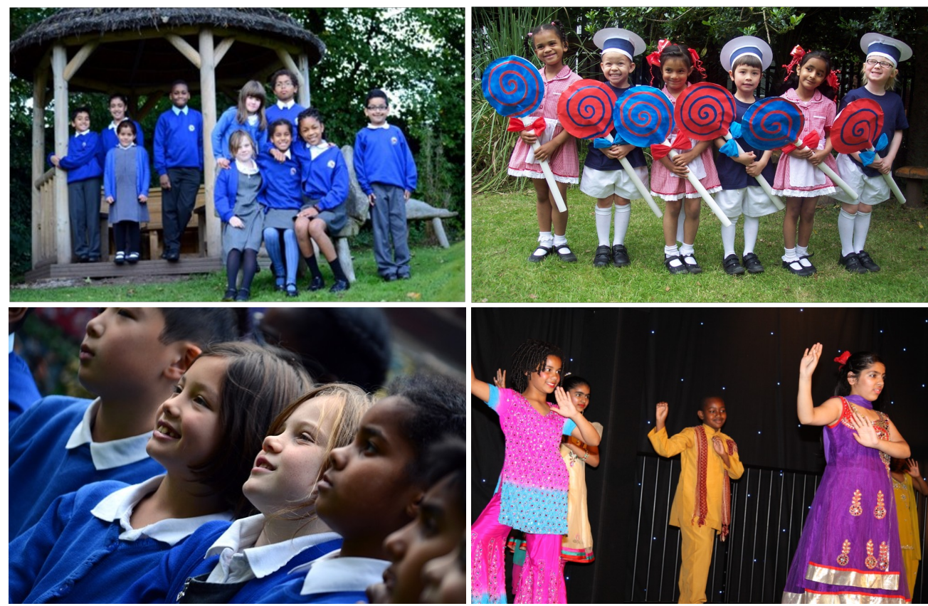
Be the best that you can be