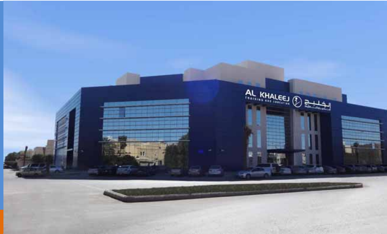
Some of Our Training Centers