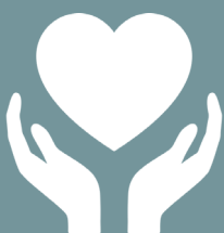
Humanity & Integrity

School 21 is a rich environment for discussion, debate, thinking and evaluation. Staff read and research, they wrestle with deep questions about teaching and learning, and they constantly look to refine and reinvent their practice. Our CPD is layered, personalised, regular and in-depth with far more time than most schools to delve deeply into practice and impact. Our staff support each other as critical friends and collaborate deeply in order to develop their teaching craft.