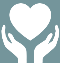
Humanity & Integrity

School 21 is a rich environment for discussion, debate, thinking and evaluation. Staff read and research, they wrestle with deep questions about teaching and learning, and they constantly look to refine and reinvent their practice. Our CPD is layered, personalised, regular and in-depth with far more time than most schools to delve deeply into practice and impact. Our staff support each other as critical friends and collaborate deeply in order to develop their teaching craft.