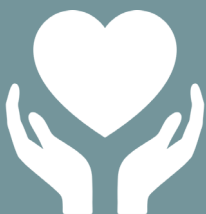
Humanity & Integrity

School 21 is a rich environment for discussion, debate, thinking and evaluation. Staff read and research, they wrestle with deep questions about teaching and learning, and they constantly look to refine and reinvent their practice. Our CPD is layered, personalised, regular and in-depth with far more time than most schools to delve deeply into practice and impact. Our staff support each other as critical friends and collaborate deeply in order to develop their teaching craft.