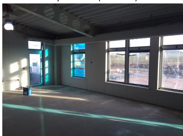
Classrooms in progress (Feb 18)