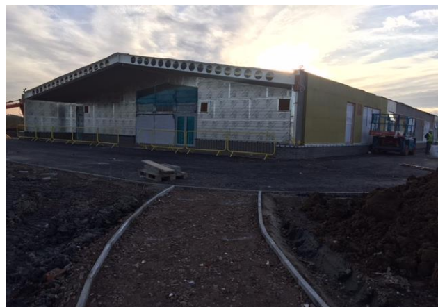
Nursery entrance (Feb 2018)