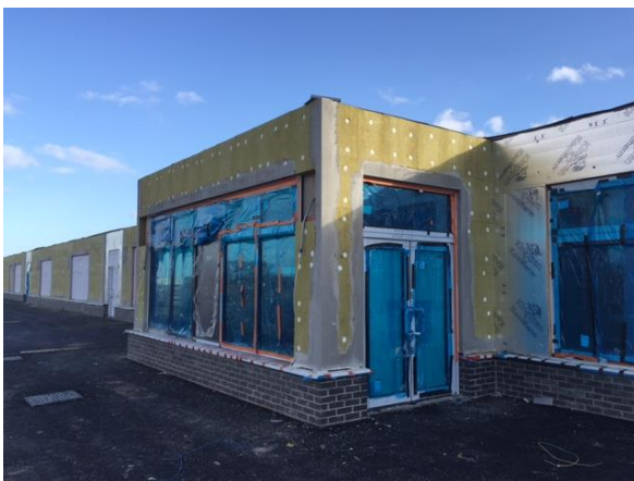
Main school entrance (Feb 2018)