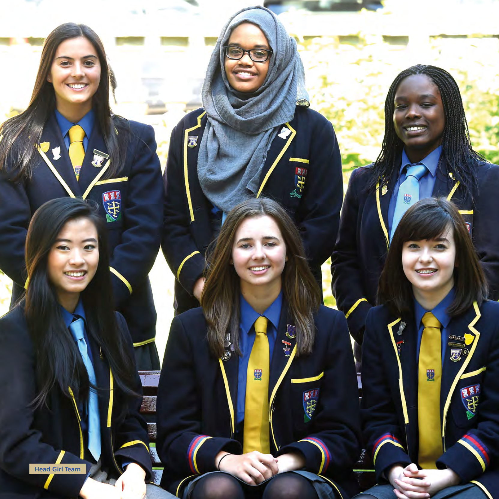
Head Girl Team