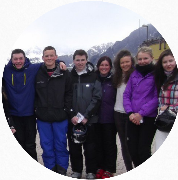
Skiing in Bormio, Italy