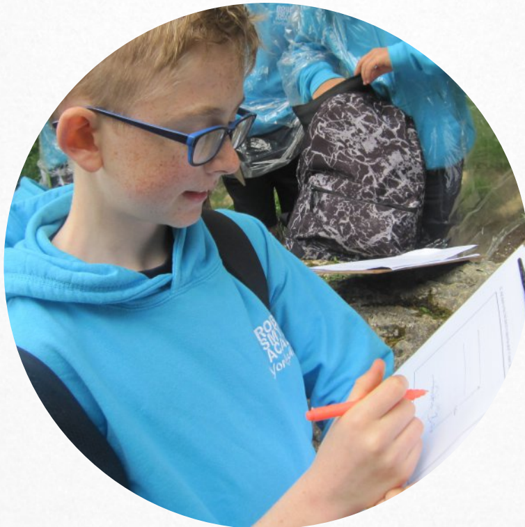
Year 7 Residential Trip to Yorkshire