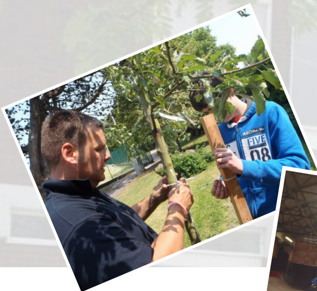
Working in the school garden