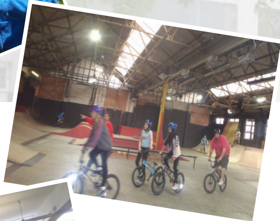
Trip to RampWorx