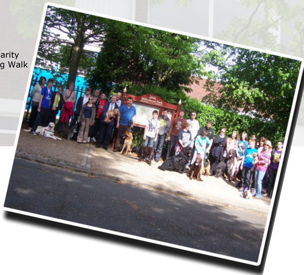
Charity Dog Walk