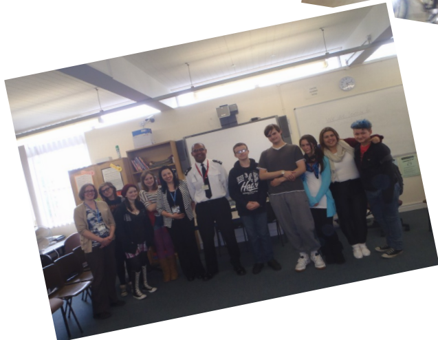
Equality & Diversity Visiting Speaker