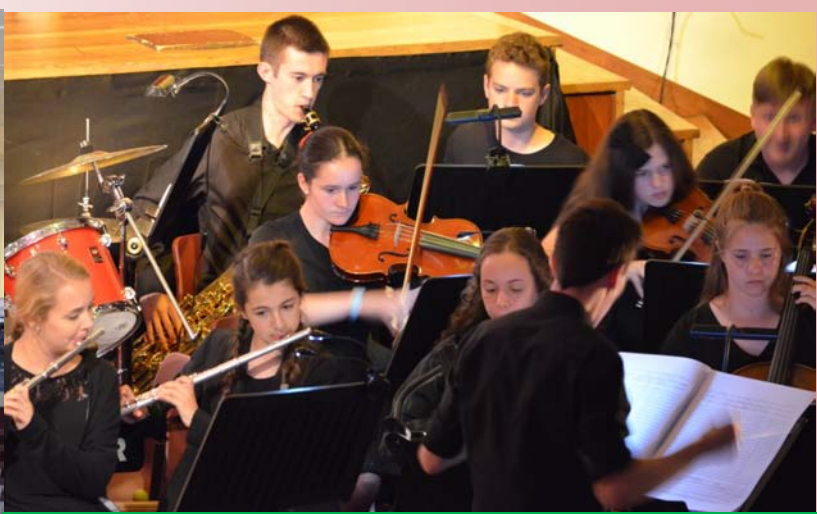
More action shots from our musical!