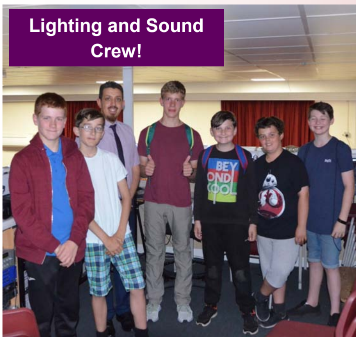
Lighting and Sound Crew!