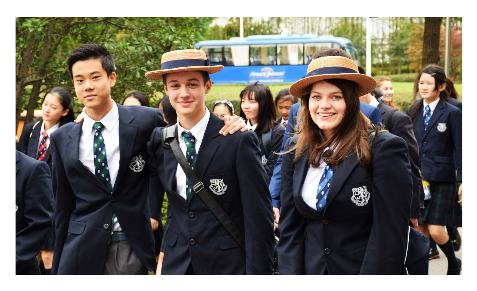
Candidate Information Pack 2017-18