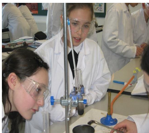
Investigating the energy content of different food types

The teaching resources in our department shared area are excellent, as are all the teaching resources within the department at all key stages.