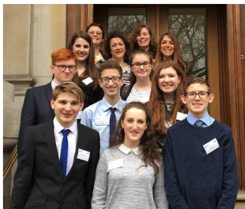
Innovate TfL finalist team outside The Royal Institute of Mechanical Engineers March 2017