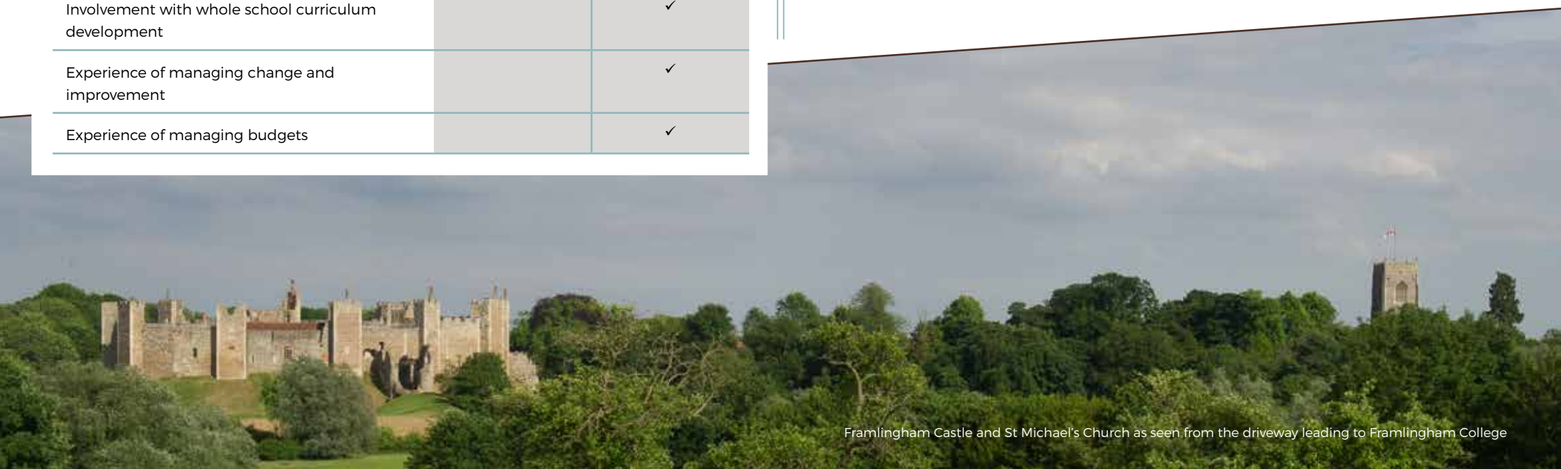
Framlingham Castle and St Michael's Church as seen from the driveway leading to Framlingham College