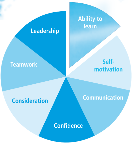
Our shared ethos for life and work Source: Ratcliffe Hall Ltd Research Review commissioned by UCST/ULT

Our research amongst top employers in the country shows the key attributes that they are looking for in those joining them either as school leavers or at graduate level. We place the development of these skills at the forefront of the education our children receive. They require a holistic approach to education which we seek to achieve.