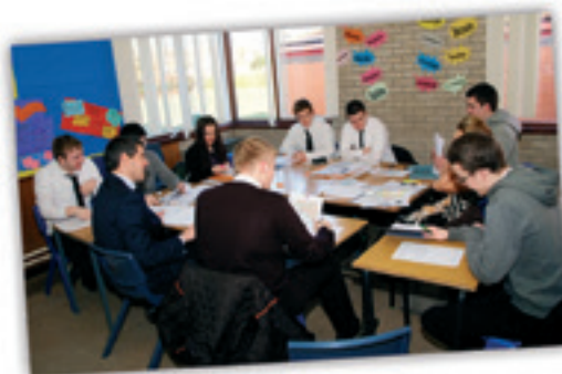
Geography A2 Level Tuition

There are a wide variety of pathways available for students who choose to join our Sixth Form. You should select the pathway that is most suited to your learning style. Our students can study a mixture of different subjects to take advantage of different assessment procedures (i.e. examinations, or set assignments like coursework). Students at Maricourt choose a range of subjects in year 12, and then continue into year 13. Through our collaborative arrangements with Deyes High School and Maghull High School, students can also enrol on options at these schools whilst still being a student at Maricourt.