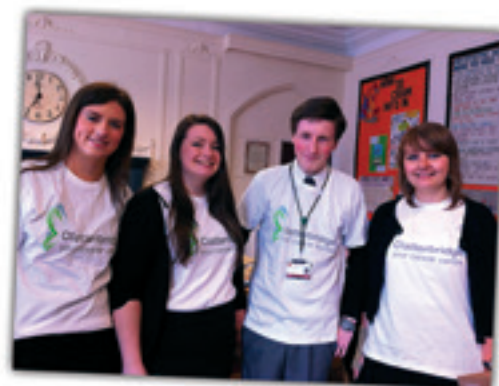
Fundraising for Clatterbridge Cancer Centre

In our Sixth Form, there's plenty of scope for the development of interests. Our regular activities range from foreign exchanges, to sports competitions and stage productions. Voluntary work is an integral part of Sixth Form life, and all students will ultimately partake in some form of voluntary work, whether it's in school or externally with a local organisation. Our students have been able to develop their skills by embarking on schemes with the Aintree Hospital NHS Trust, HCPT Lourdes, homeless shelters, primary schools, care homes and with our partner school St. Raphael's in Sierra Leone, Africa. Internally, our students frequently organise charity fundraising events. These activities give our students a major competitive advantage for their future.