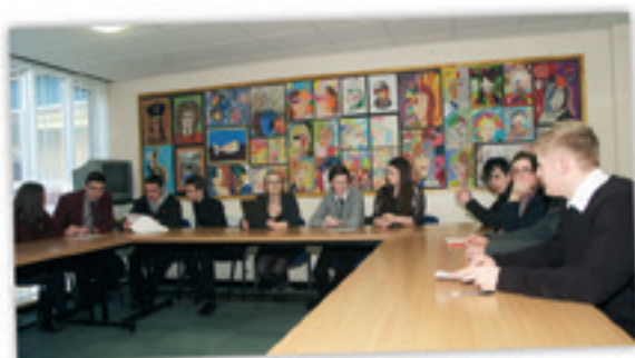
Coming up with new ideas and suggestions on the School Council

The school has been awarded the Connexions Local Quality Award in recognition of the high standards of careers advice given to our pupils and students.