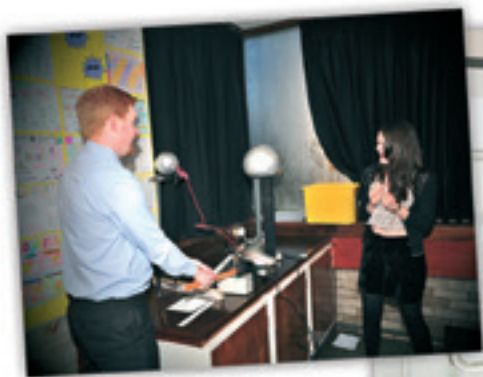
Van der Graaf electrostatic generator in physics (top) Testing for pH in acid-alkali reactions in chemistry (right)

Maricourt has several science laboratories and computer rooms that are specifically designed to cater for the three scientific divisions: biology, chemistry and physics . Each laboratory is complete with a plethora of equipment for experiments that are relevant for Key Stages 3, 4 and 5 (Sixth Form). Safety in the labs is of paramount importance.