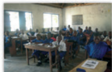
St Raphael's, Sierra Leone

The Sisters take over a nearby building planned to be St. Paul's Catholic Modern Secondary School , but instead became part of Maricourt (now Arnold Hall). By 1968 the transition is complete and the school becomes a co-educational comprehensive under the name Maricourt Catholic High School, welcoming boys and girls.