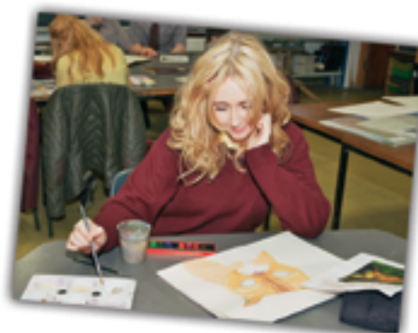
Art and Design

Information about what day-to-day life involves for Maricourt pupils and students.