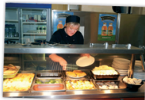
Lunch at St. Joseph's Dining Hall

Maricourt is very proud to have been awarded Healthy Schools status for our school meals and our role in educating young people about the importance of eating healthily.