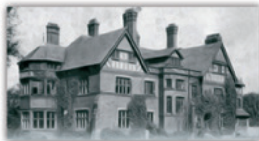
Quarry Brook House (the Convent) before the construction of adjacent buildings

Maricourt has a unique and rich heritage in which the values of the school are rooted. The story of Maricourt from its conception in 1957 to the present day is not only interesting, but it inspires all of our pupils, staff and students. Traditions are very important to the school and they form an essential part of life at Maricourt. Here is a brief summary of Maricourt's history.