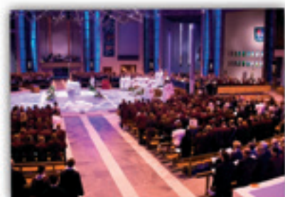
50th Anniversary at the Cathedral

In the same year, the school forms a partnership with St Raphael's Secondary School in Sierra Leone, Africa (pictured).