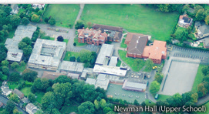
Newman Hall (Upper School)