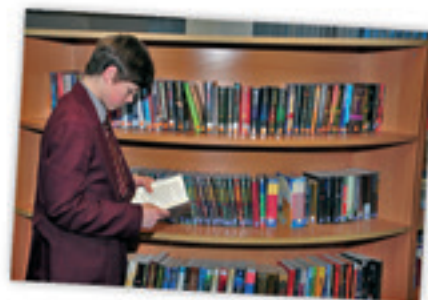
Borrowing a book from Newman Resource Centre

As per the school rules, pupils and students must be organised. They need to take responsibility for being equipped with the right stationery, books, PE kit and any other items needed for the school day.