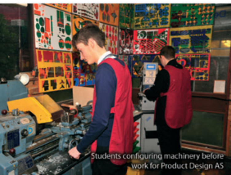
Students configuring machinery before work for Product Design AS