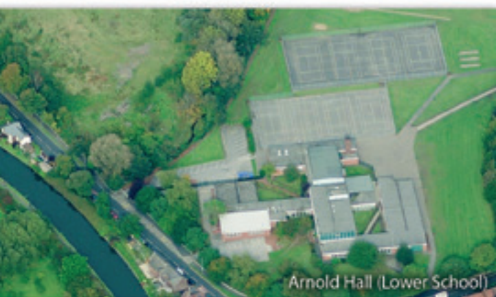
Arnold Hall (Lower School)