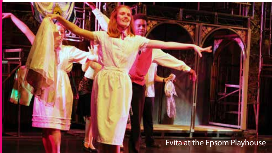
Evita at the Epsom Playhouse

Additionally, being involved in these activities will contribute to the schools' house system and earn points towards the house cup. We believe that residential trips truly add to a student's life. Our expectation is that all students will take part in an activity outside of the classroom. These experiences will enrich their lives, improve their skills and help them to enjoy school life to the full.