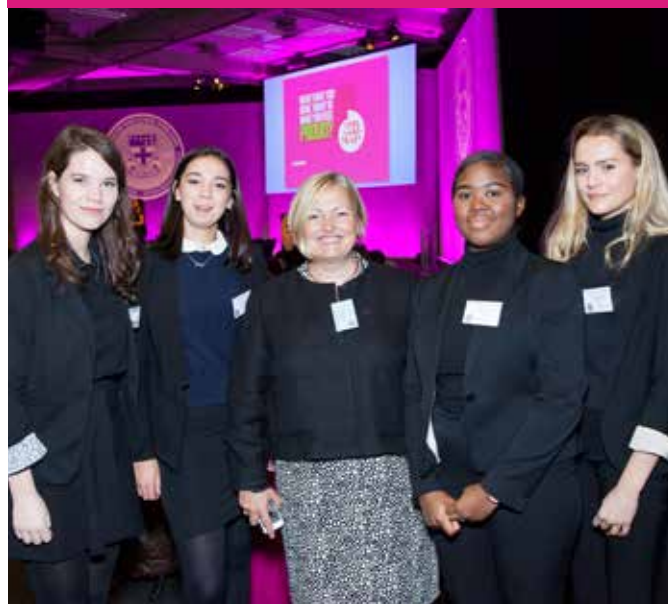
Women of Faith; Leading the Change Conference