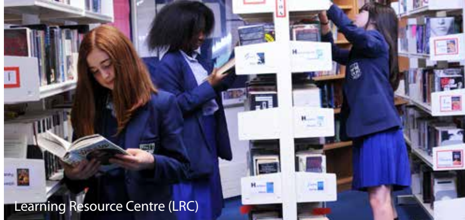
Learning Resource Centre (LRC)

We publish our annual programme on our website and update this termly. Some of the enrichment activities at KS3 and KS4 include: