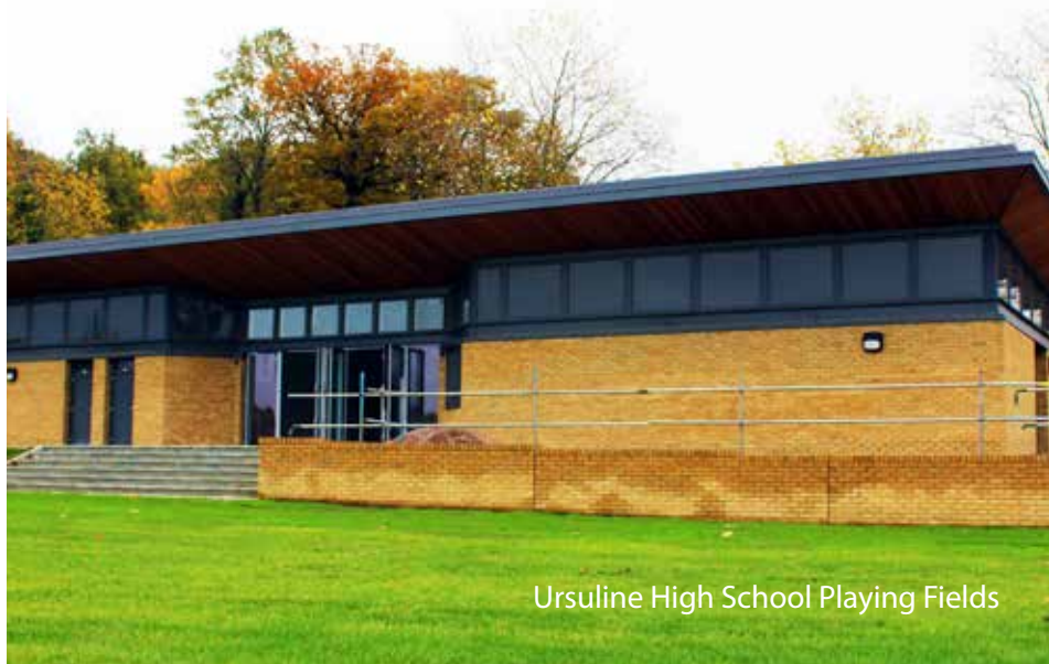
Ursuline High School Playing Fields

Our brand new playing fields and pavilion at Morley Park are just a short walk from the school grounds and will be available to students (for use during P.E. lessons and other sporting activities) from September 2017. The facilities will include football pitches, changing rooms and an indoor space for wet weather conditions. We are looking forward to expanding our sport offering (to include cricket), They are a wonderful addition to the school facilities.