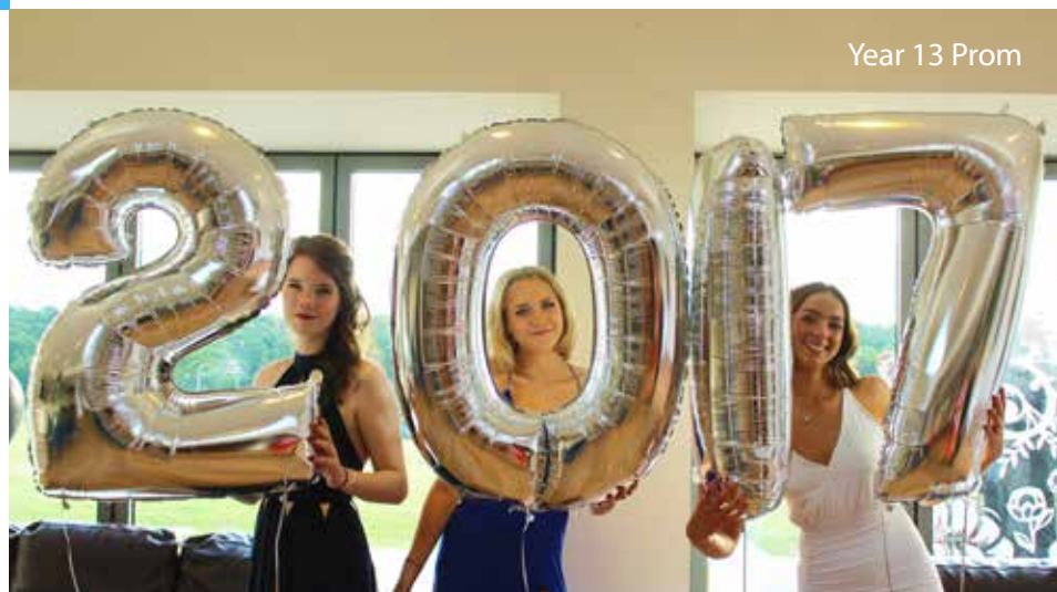
Year 13 Prom

Students actively contribute to the life of the school and are invited to participate in leadership training in school council, chaplaincy programmes and community service. This programme of enrichment includes: Science Gold Crest Awards; Cannon of English; Duke of Edinburgh; Art Portfolio and World Religions . There are many opportunities for travel through cultural enrichment trips and language exchange programmes.