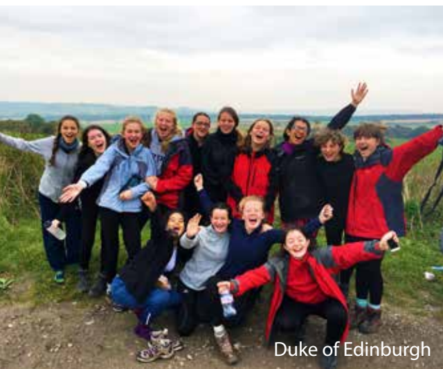
Duke of Edinburgh

Ursuline High School has been in the top 1% of schools nationally for value added for three consecutive years. In 2016, 90% of students achieved 5A*-C including English and Maths in their GCSE examination results.