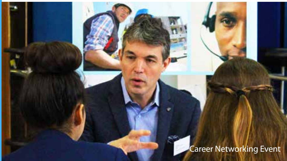
Career Networking Event

Performances and events such as the school production, the St Cecilia Concert , Art Exhibitions and Multicultural Evening provide opportunities for parents and students to celebrate both the arts and our diverse community.