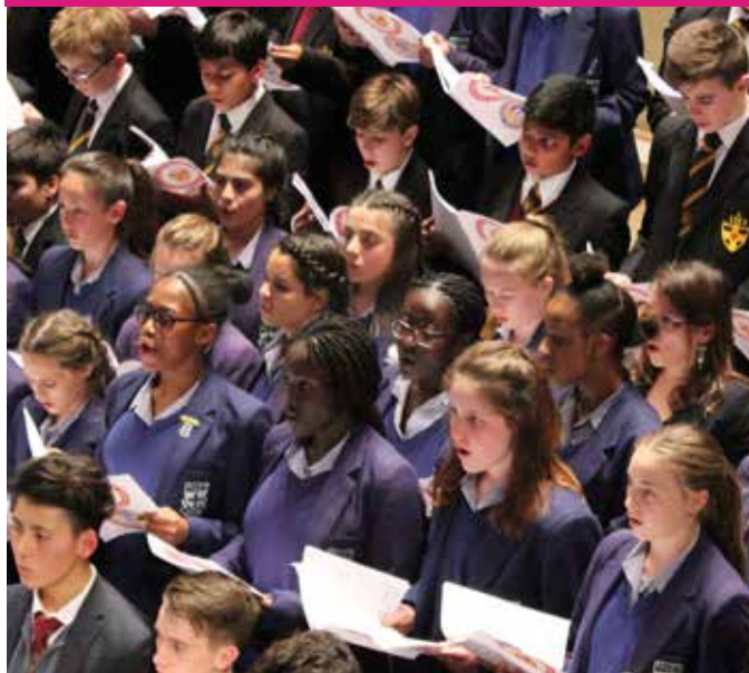
St Cecilia Concert at St John's Smith Square