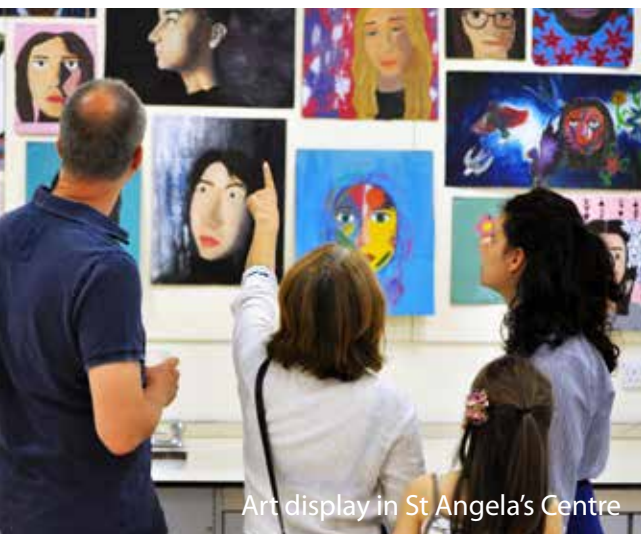
Art display in St Angela's Centre

From specialist rooms for Food Technology lessons to computer rooms for ICT, and tranquil quad area (with outdoor seating) for chatting with friends at break-time, we have a campus which facilitates the optimum environment for learning.