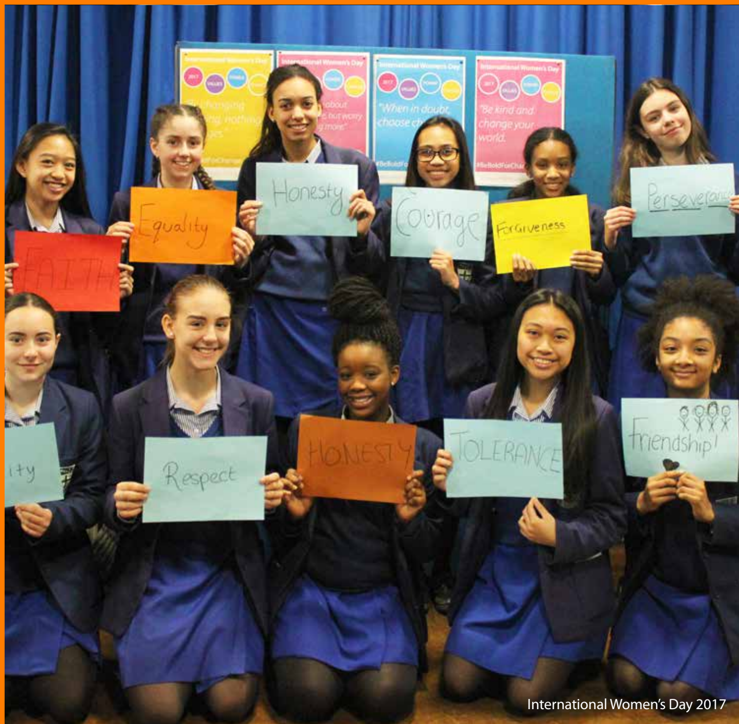
International Women's Day 2017