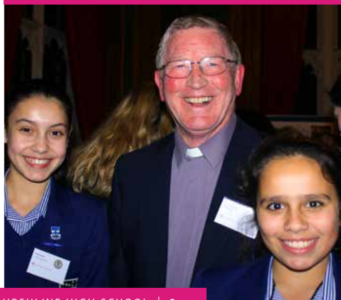
House of Lords