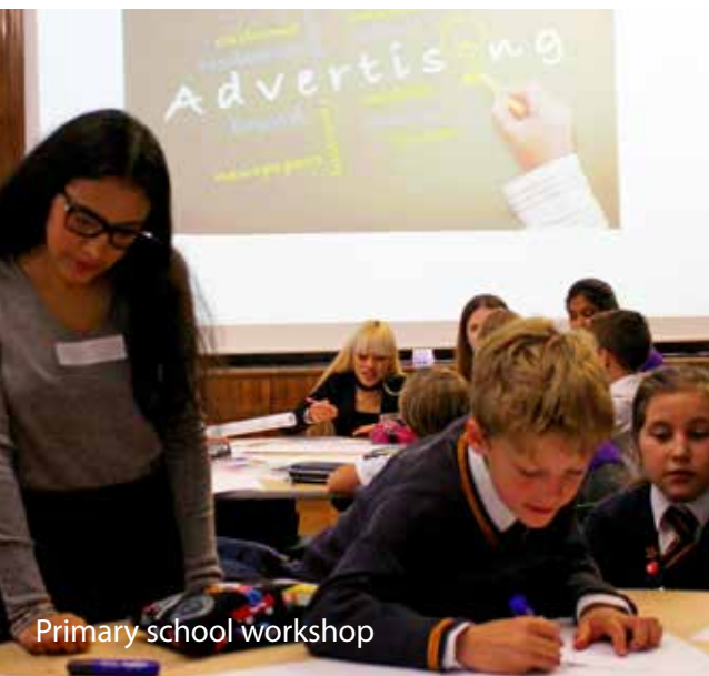
Primary school workshop

"Having the opportunity to be a sports leader has improved my self confidence and it's a brilliant skill to add to my CV when I'm older."