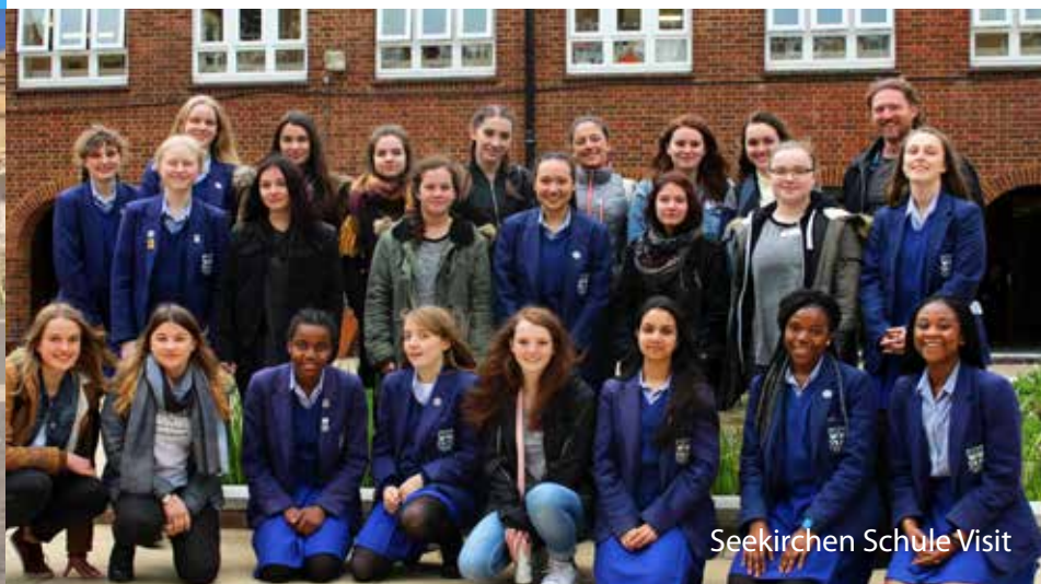
Seekirchen Schule Visit