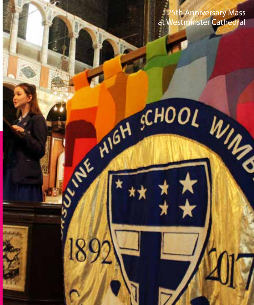
125th Anniversary Mass at Westminster Cathedral