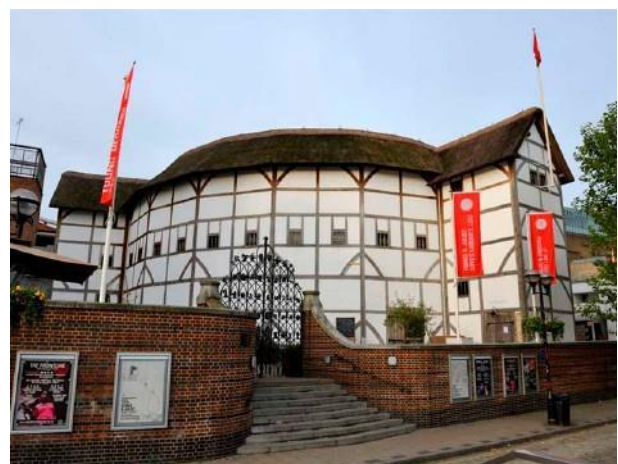
Shakespeare's Globe Theatre