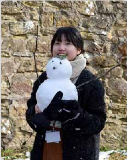
Ice, Ice, Baby!