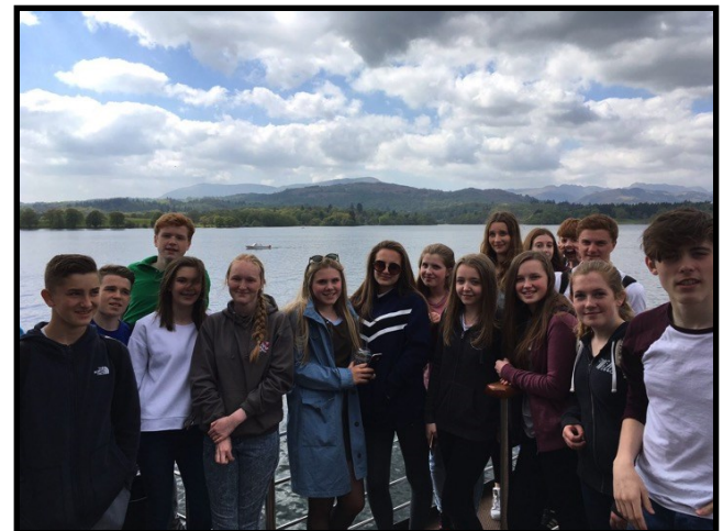
GCSE Fieldwork in Bowness