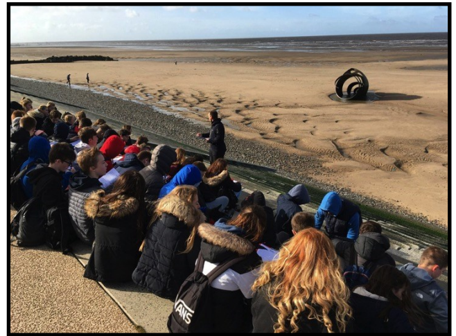
Examining flood defences in Cleveleys