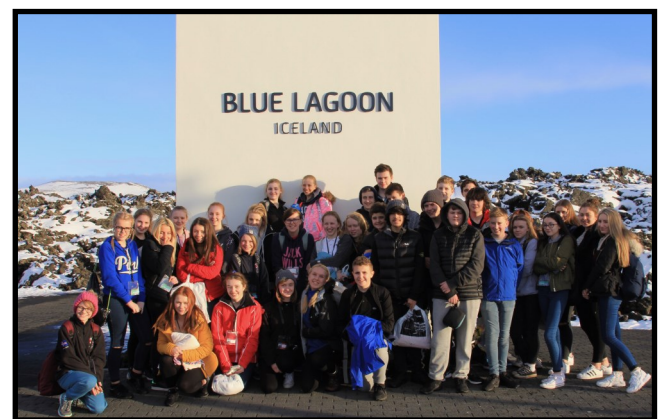
Field visit to Iceland