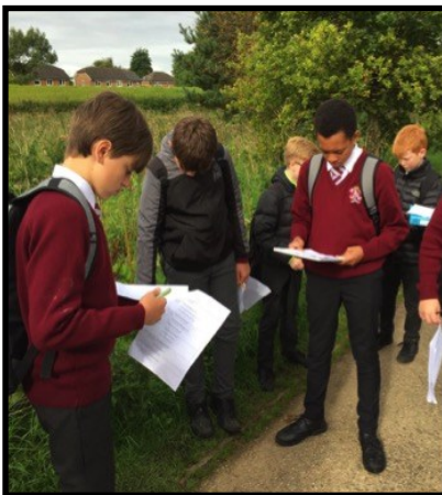
Year 9 Fieldwork in Garstang

The department is well resourced, with class teachers having their own teaching rooms. All staff and students have tablets for use in class and as such we have access to a range of apps and software to develop GIS in the classroom. We also have an active membership with the Geographical Association.