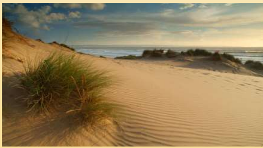
Nearby at Saunton Sands

A Community Sports Hall is managed by the school. A floodlit artificial turf pitch on the school site benefits both the school and the community. Further sporting facilities have been developed, including a new floodlit regional netball centre of six courts.