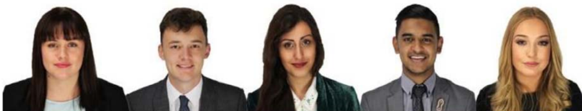
Our Head Prefect Team 2017-2018