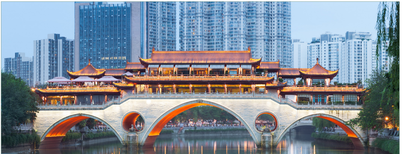
Chengdu has a rich heritage and a moderate continental climate.

The school is situated about an hour's drive from the centre of Chengdu. Chengdu is home to many multinational companies and a large tourist industry, and is a lively city with a friendly and vibrant local and expat community. There is a fast, clean metro system running across the city. For travelling to and from China the airport is a 40 minute drive from the school.