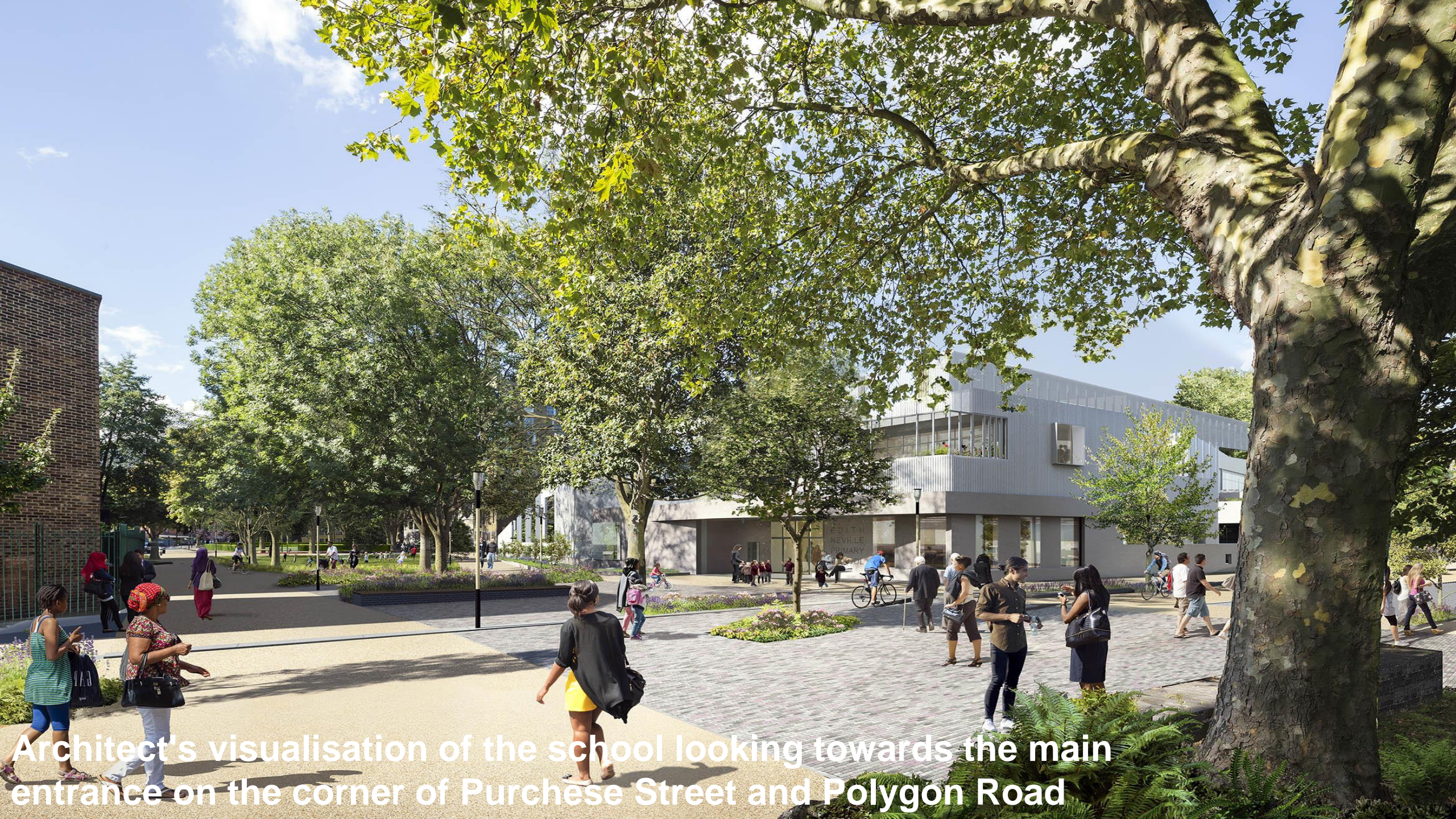
Architect's visualisation of the school looking towards the main entrance on the corner of Purchase Street and Polygon Road