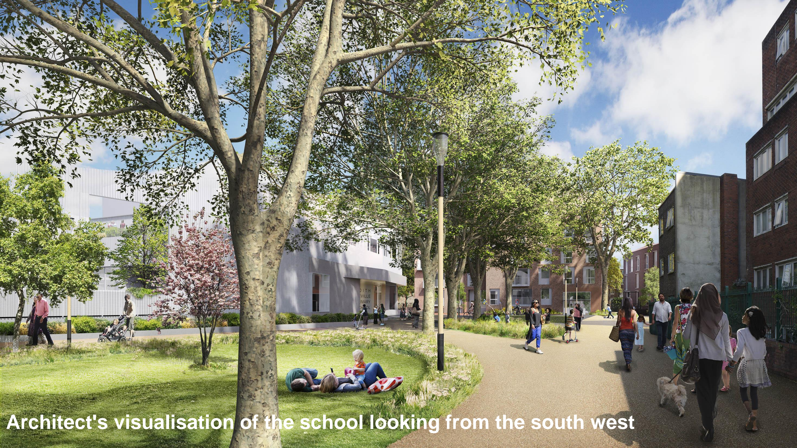
Architect's visualisation of the school looking from the south west