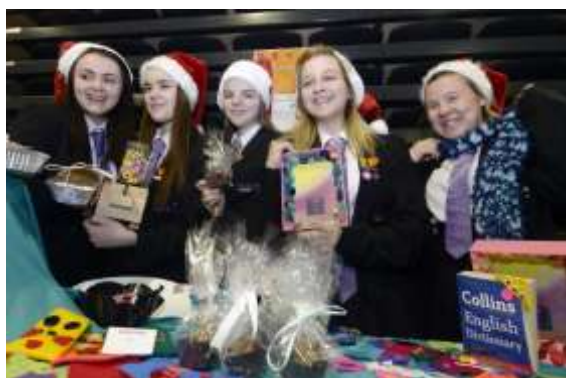
Charity Christmas Craft Fair

Furness Academy also has a strong sense of social responsibility, therefore, alongside the above events we hold a number of charity events throughout the year that our staff and students actively participate in. These include sponsored walks, funfairs, craft fairs and coffee mornings.