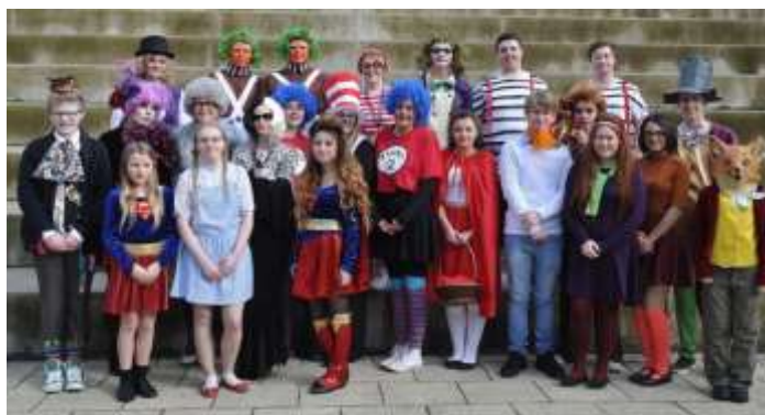
World Book Day 2016