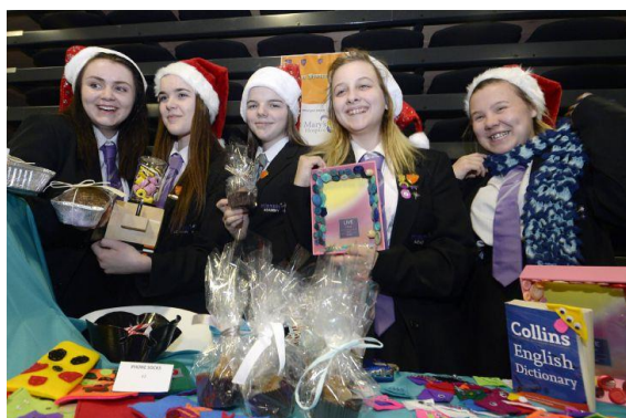
Charity Christmas Craft Fair

Furness Academy also has a strong sense of social responsibility, therefore, alongside the above events we hold a number of charity events throughout the year that our staff and students actively participate in. These include sponsored walks, funfairs, craft fairs and coffee mornings.