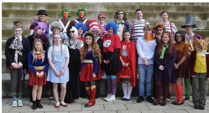
World Book Day 2016