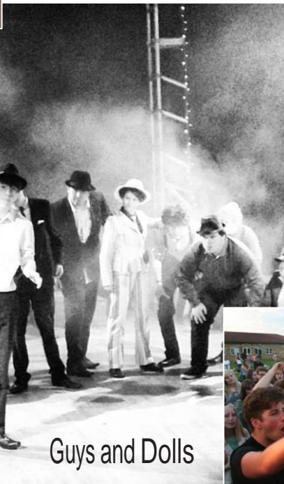
Guys and Dolls