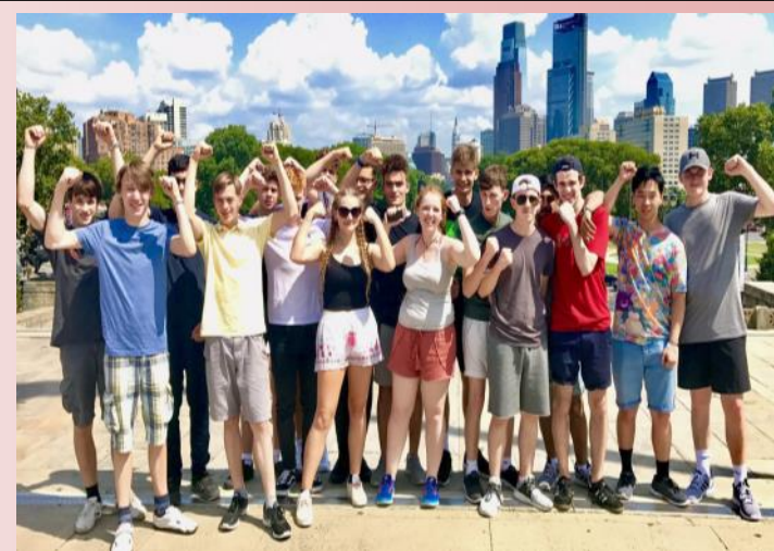
Photo featured is from this year's USA trip. Watch this space for details of the 2019 trip !!

Follow us at @allhallows and on Facebook (All Hallows Catholic School).