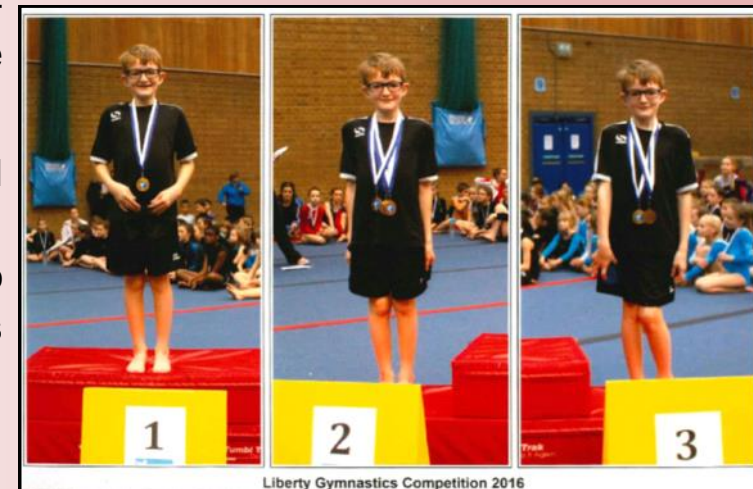
Liberty Gymnastics Competition 2016