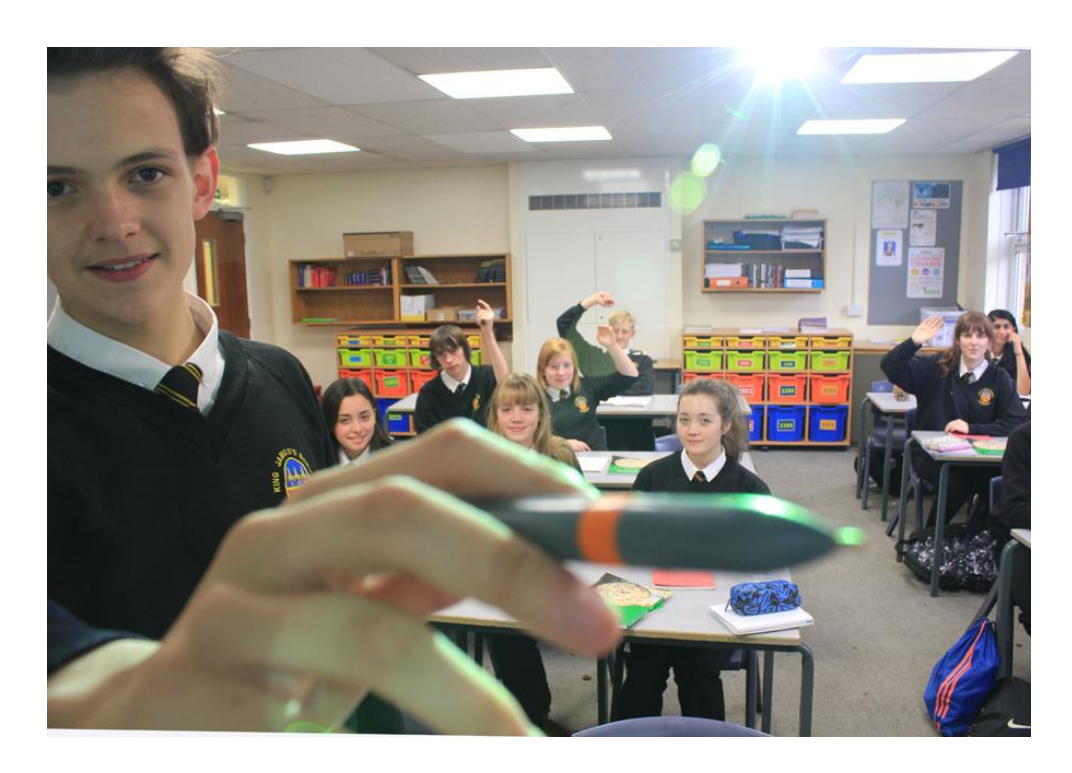
'The school's work to keep students safe is outstanding. Teachers ensure students know how to stay safe in all contexts, including online' - Ofsted 2015

'Leaders and managers have a relentless focus on improving the school and on ensuring the very best outcomes for every student. They have successfully ensured that students' results have remained very high over time' - Ofsted 2015