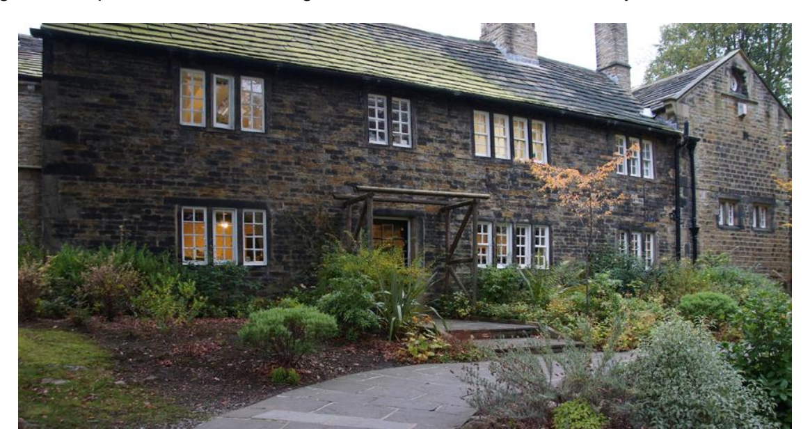
'The school prepares students exceptionally well for life and work after school, and the school's success and expertise in this area are nationally recognised' - Ofsted 2015

King James's, whose origins go back to the thirteenth century and has occupied its present site since 1547, was designated a Specialist Science College in 2004 and became an Academy in 2012.