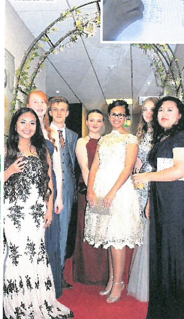
Pupils arriving for the Leavers' Prom

"The 2017 leavers have worked very well with the wonderful staff we have here to ensure that they did their very best. On the whole people are leaving very happy."