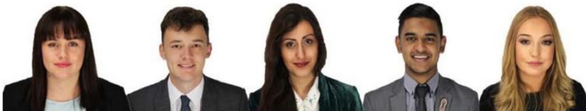
Our Head Prefect Team 2017-2018