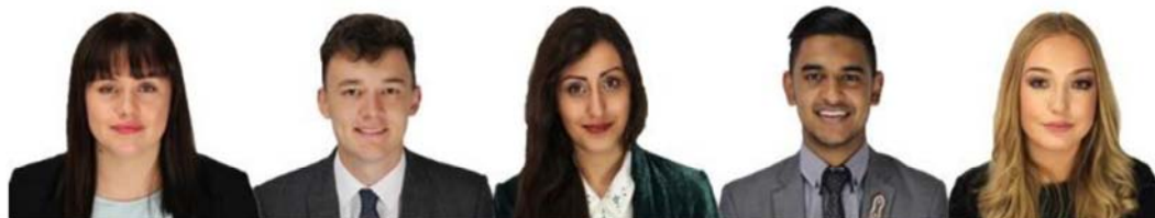
Our Head Prefect Team 2017-2018

Closing date: Tuesday 20 March 2018 at 9.00 am