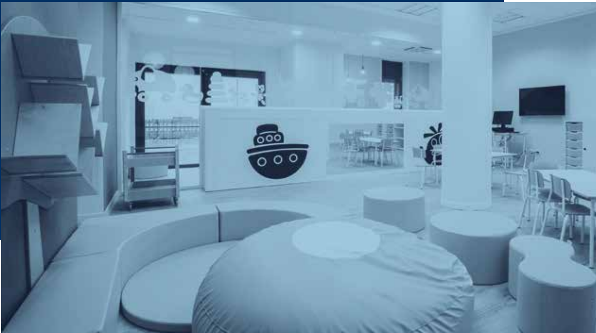
Bright classroom, eco-friendly design