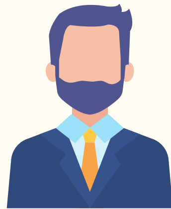
Specialist Teachers Position filled