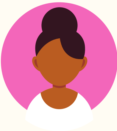
Educational Psychologist Position filled