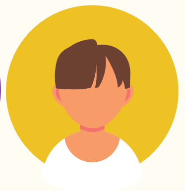
Speech and Language Occupational Therapy Positions filled