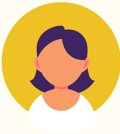
Head of Centre Position filled

We will introduce a wealth of expertise to the region across various fields. Our team members will hold QTS qualifications and the highest level of accreditation in their respective areas. They will be not only expertly qualified but also empathetic and innovative in their approaches.