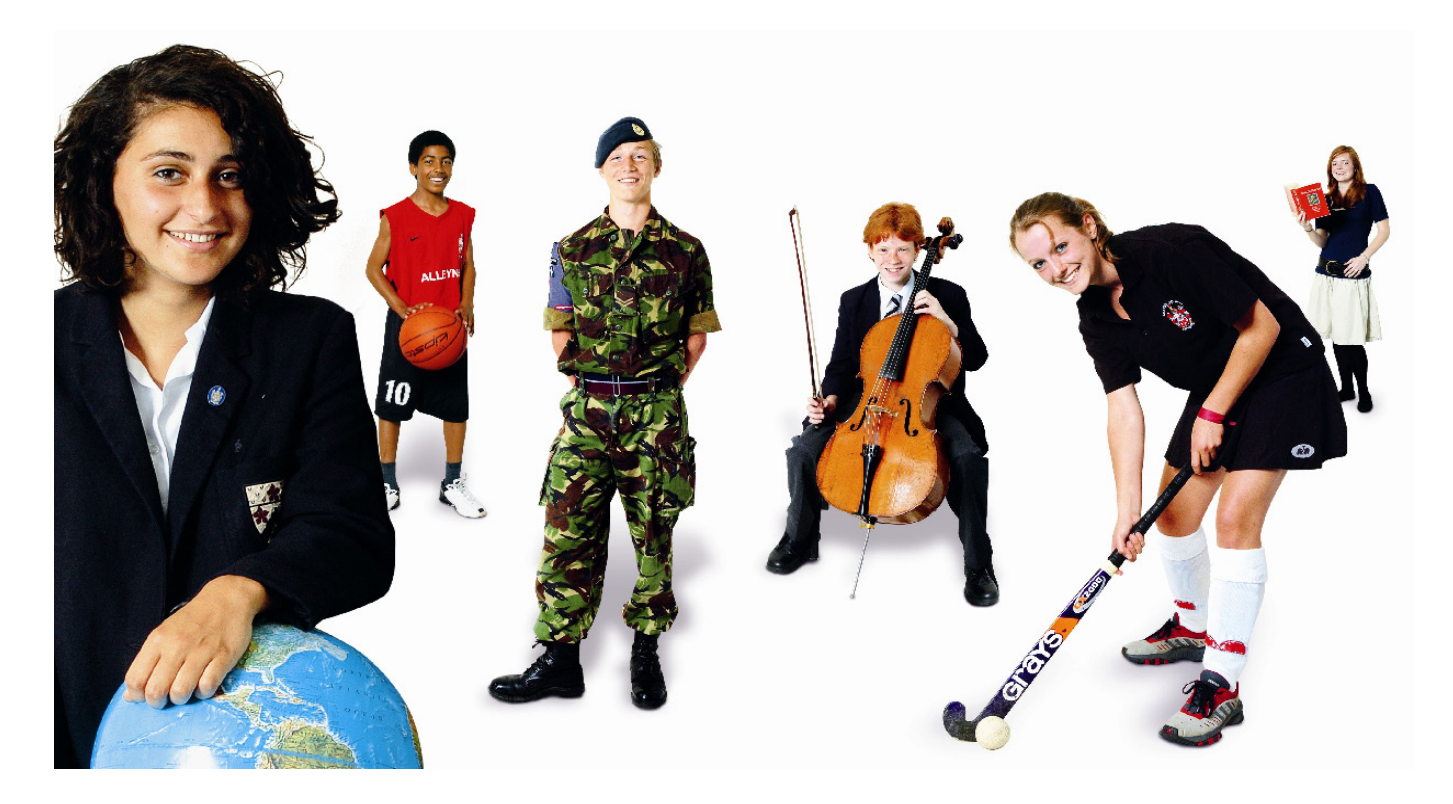
For further information, including the latest news and exam results, please visit our website www.alleyns.org.uk

Alleyn's School is an Equal Opportunities employer and welcomes applications for all posts from appropriately qualified persons regardless of age, disability, ethnicity, gender, marital status, sexual orientation, religion or belief.