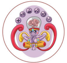
Flexibility of Mind