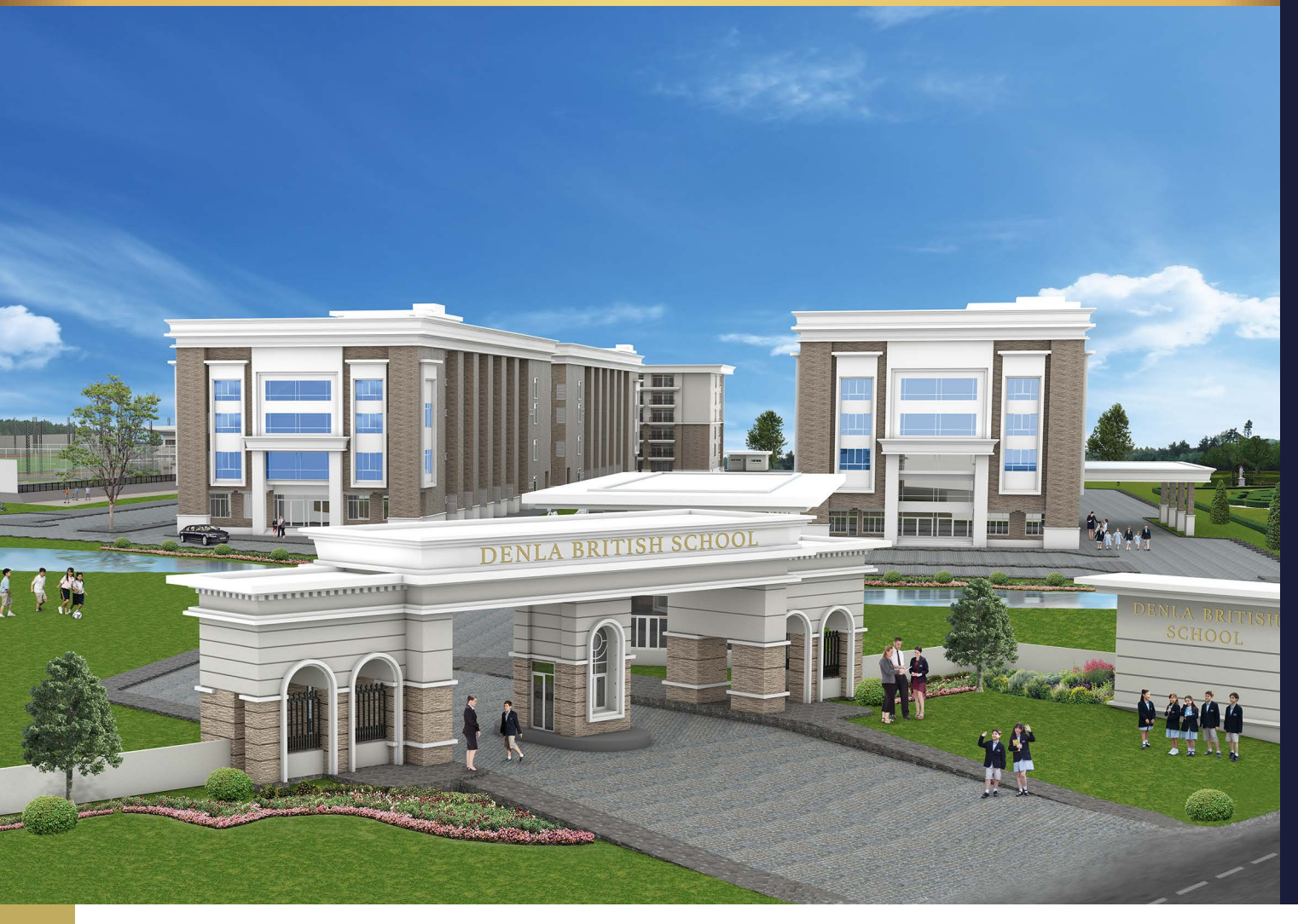
Appointment as soon as possible