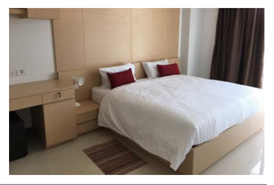
KEY STAGE 1 CLASS TEACHER | 5

Our staff enjoy the convenience of on-site, secure living in wellappointed 1, 2 or 3 bedroom, fully furnished, apartments. The staff accommodation will include a communal pool, gym, gardens and a sitting area suitable for receiving guests. Shopping malls and restaurants are close by and a trip downtown will take approximately 45 minutes. Taxis are at least 75% cheaper in Bangkok than they are in Thailand.