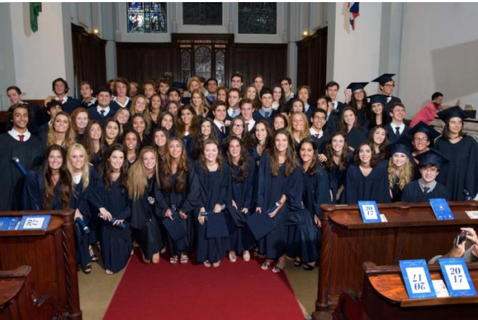
Urca Site Graduates – Class of 2017

In addition to being an IB World School, The British School has been accredited by the Council of International Schools (CIS) since 1999 and is visited by teams from CIS every 5 years in order to assess the quality of operations and programmes across all sites.