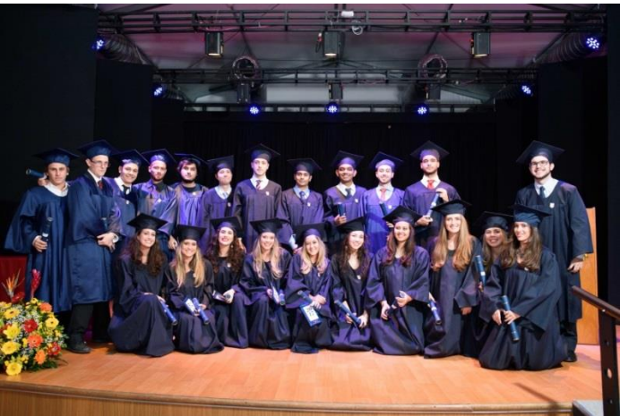
Barra Site Graduates – Class of 2017

Europe 14 % North America 32 % Brazil 42 % Other 5 % Undecided 7 %