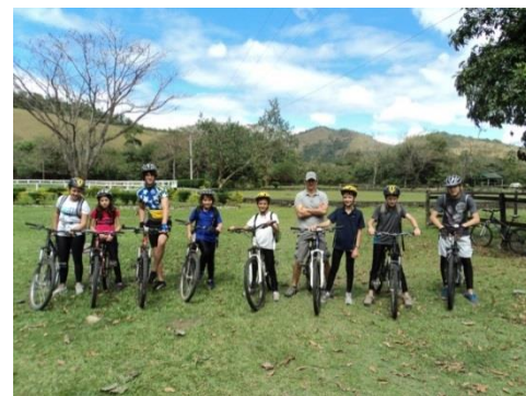
Duke of Edinburgh’s International Award expeditions