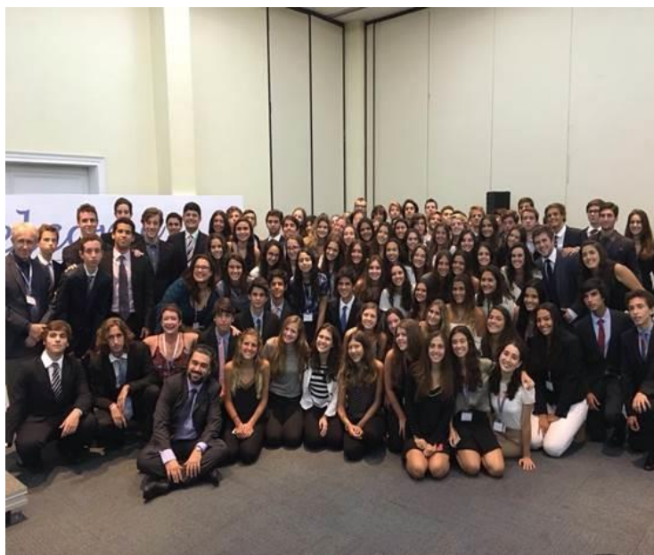
TBSRJ MUN 2017

An outdoor activities programme is also extremely popular – with large numbers of students pursuing The Duke of Edinburgh’s International Award - and a wide range of fieldtrips and international visits take place. A House System is well established in the Upper Primary and Senior sections and is designed to promote opportunities for healthy competition in a range of activities. In the Senior School, Model United Nations is thriving and a very active community service programme is established. Despite its lack of modern sports facilities the school is also remarkably competitive in local sporting competitions. This reflects the hard work, community spirit and strong sense of purpose that pervades the school.