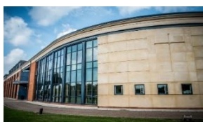
Bluecoat Aspley Academy

The growth of the Trust is a truly exciting time for prospective candidates who are looking to further their careers in a dynamic learning community that has opportunity at every point to share and learn from each other in order to become the best that we can be.