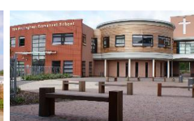
Nottingham Emmanuel School