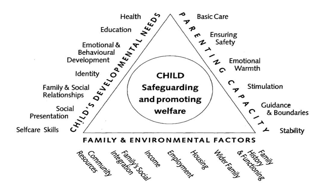
Working Together to Safeguard Children (DFE, 2015)