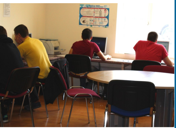
Computer workstation suite