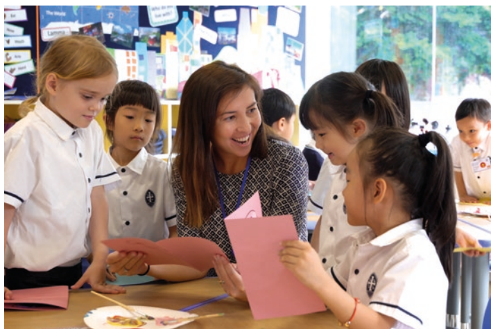
Wycombe Abbey School Hong Kong

BE Education counts many elite schools in the UK and US as clients. BE Education takes an active role in school management: in particular, in representing and providing advocacy for the schools at local and national government level.