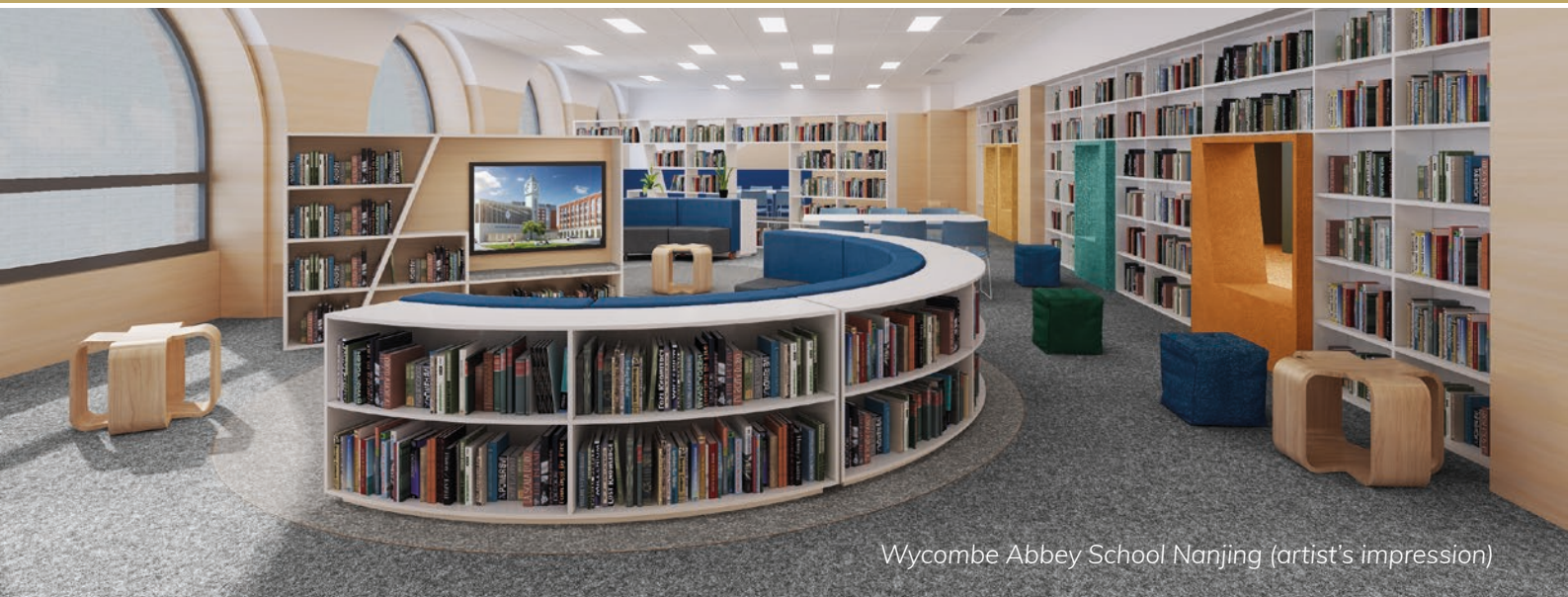
Wycombe Abbey School Nanjing (artist's impression)