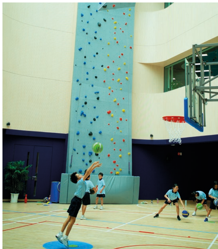
Wycombe Abbey School Hong Kong