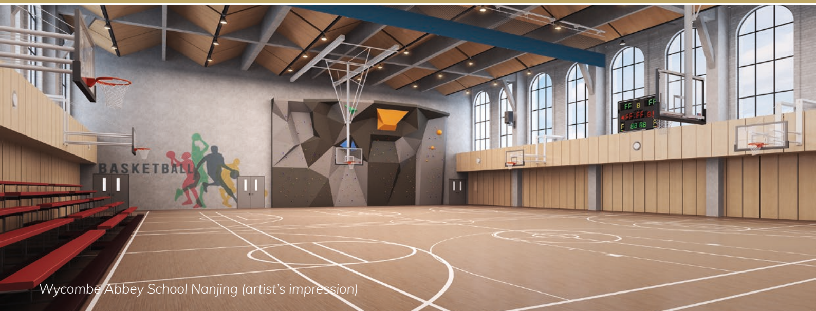
Wycombe Abbey School Nanjing (artist's impression)