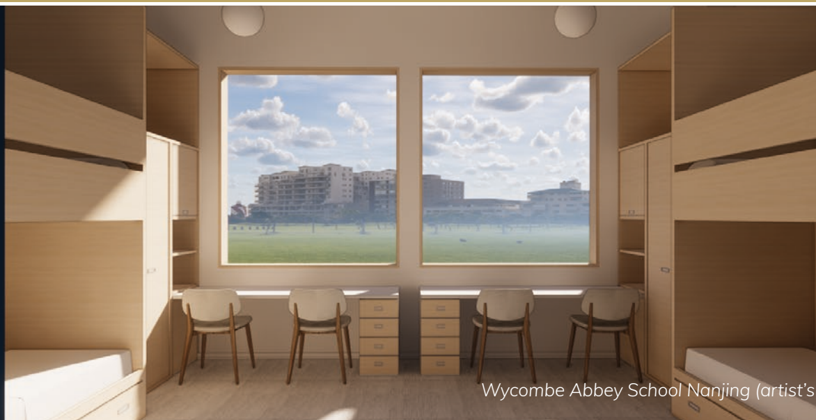
Wycombe Abbey School Nanjing (artist's impression)