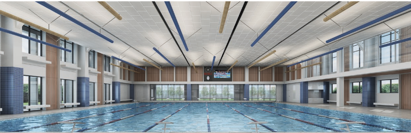
Wycombe Abbey School Nanjing (artist's impression)