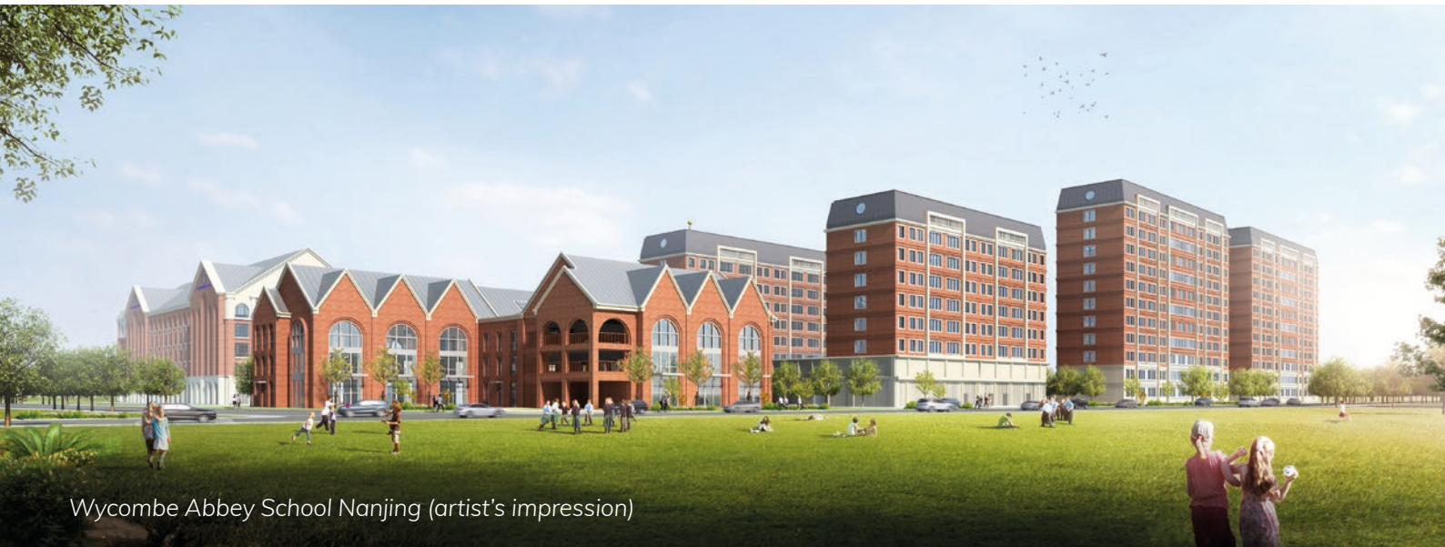
Wycombe Abbey School Nanjing (artist's impression)