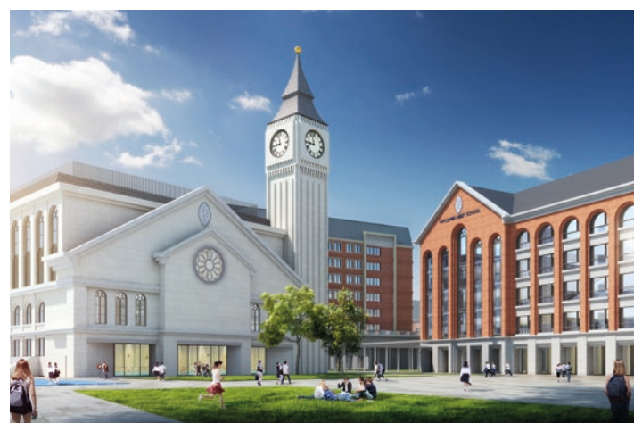
Wycombe Abbey School Nanjing (artist's impression)