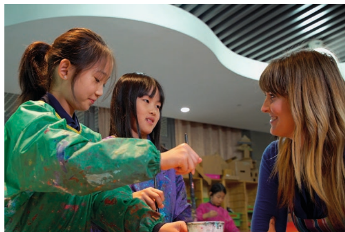
Wycombe abbey School Hangzhou