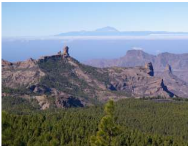
Roque Nublo- a famous landmark