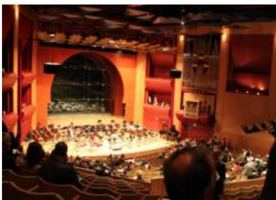
The Alfredo Kraus Auditorium

living between Gran Canaria and the UK. Some things are cheaper, while other items are more expensive. In general, eating out is cheaper than the UK.