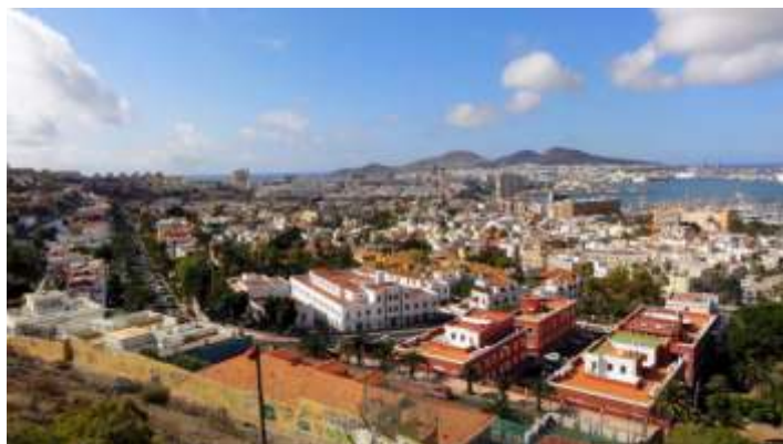
Partial view of the city - from Ciudad Jardín

cheaper but teachers are warned that they can be quite cold in winter and they will need their own transport. Teachers living in Las Palmas may travel to the Primary and Secondary Schools in San Lorenzo, free of charge on the school buses. There are several pickup points in the city. Teachers in the Infant School in Las Palmas and the South school must find their own way to school but this