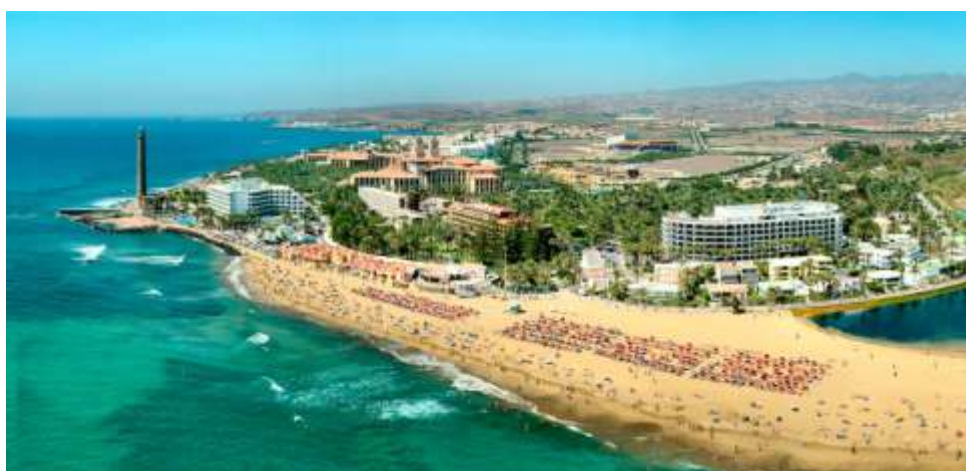
Maspalomas beach in the south

teachers. This is a legal requirement and entitles you to the Health and Social Security system. Family members may be included but boyfriends/girlfriends will not and will therefore have to make alternative arrangements. Friends or partners who do not speak Spanish and have no job arranged will find it difficult to obtain work not related to teaching.