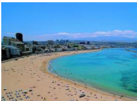
Las Canteras beach