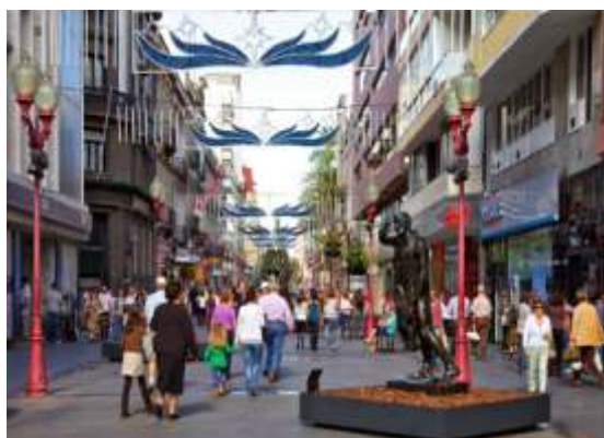
Triana shopping area