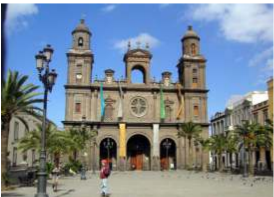
Cathedral in Old Town