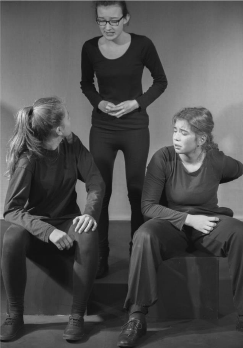
Drama at Wood Green School