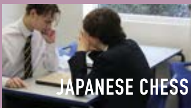
JAPANESE CHESS 'SHOGI'