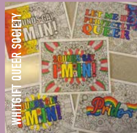
WHITGIFT QUEER SOCIETY