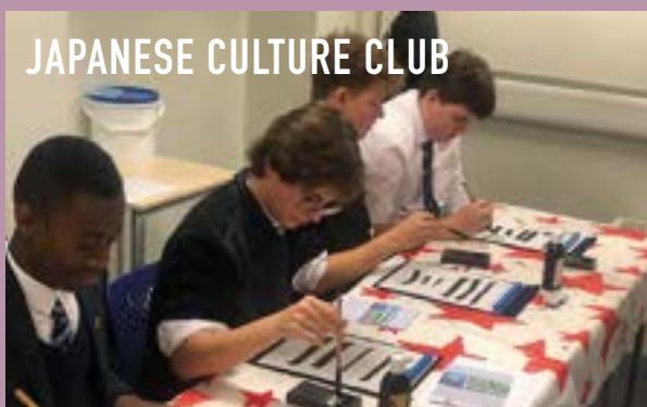
JAPANESE CULTURE CLUB