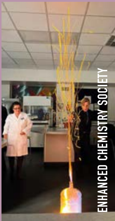
ENHANCED CHEMISTRY SOCIETY