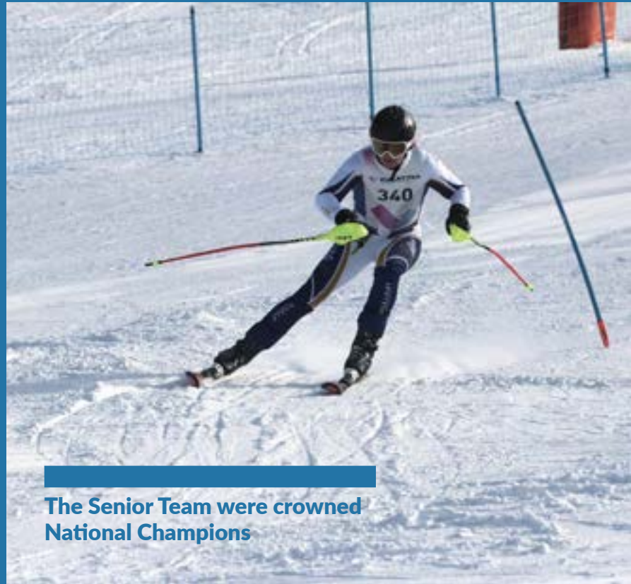
The Senior Team were crowned National Champions

In 2022, 37 Whitgiftians (First Form–Upper Sixth) competed in the Independent School Ski Championships in France. They achieved Senior Team Silver in slalom and combined, and the Senior Team Gold in giant slalom, crowning them National Champions .