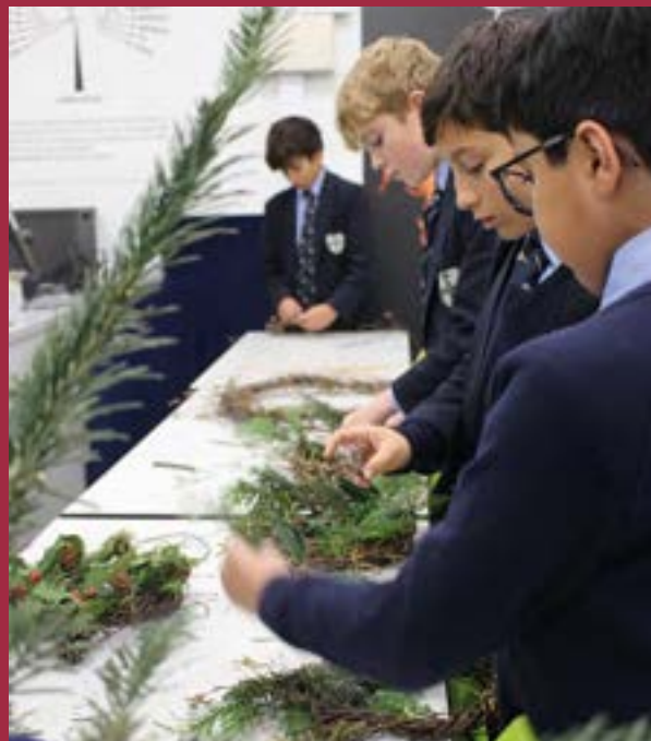
Students created Christmas wreaths for their families