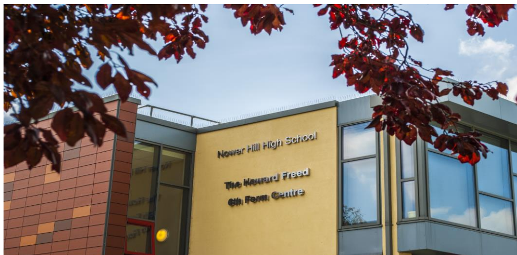
Nower Hill High School, 6 th Form building

The recent additions to our site are a superb 6 th Form Centre, a first class English teaching block (13 classrooms), an additional block of 5 state of the art Science labs (making a total of 16 Science labs) and an excellent Fitness Suite which is free for students and staff to use. The school site and buildings are well looked after with £4m being spent on new roofs, windows and toilet blocks over the last few years. There are further projects in the pipeline, including new PE changing rooms.