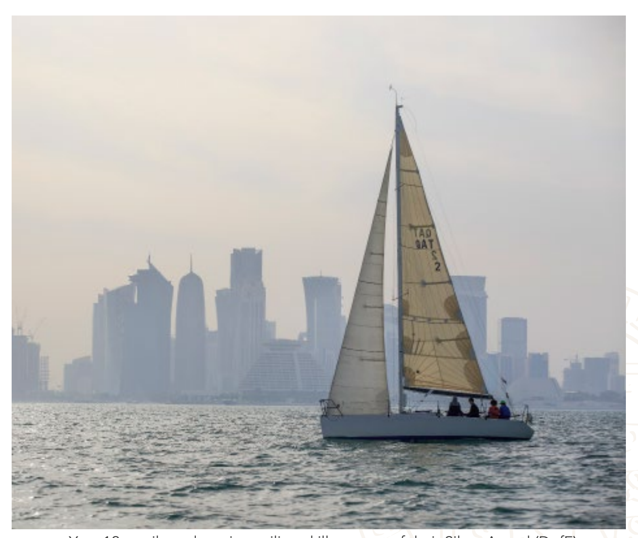
Year 12 pupils undergoing sailing skills as part of their Silver Award (DofE)

Clothing must conform to the local customs and cause no offence to any parent or local visitor. It should be neat, clean and in good repair at all times. Colleagues should not wear visible jewellery or similar artefacts that are culturally sensitive, distracting or which cause disruption to the educational environment.