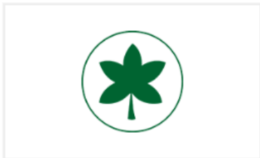
DARRICK WOOD JUNIOR SCHOOL