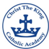
Christ the King Catholic Academy