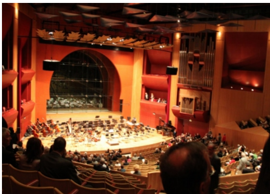
The Alfredo Kraus Auditorium

heating bills one has in the UK and it is necessary to buy bottled water for drinking.