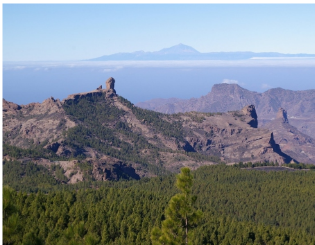
Roque Nublo- a famous landmark