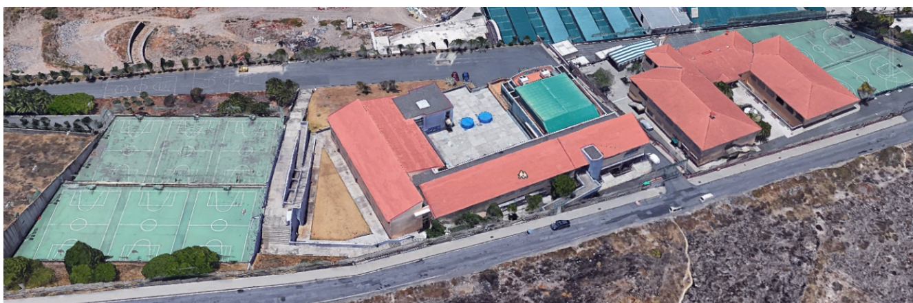
Canterbury School of Gran Canaria. The Primary and secondary Departments