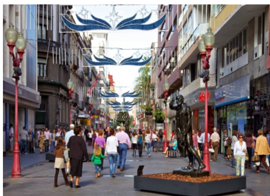
Triana shopping area