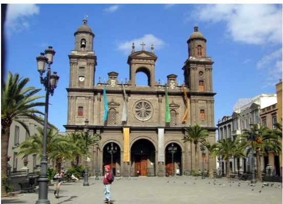
Cathedral in Old Town