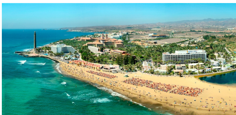
Maspalomas beach in the south

As previously mentioned, apartments and houses outside Las Palmas are cheaper, but teachers are warned that they can be quite cold in winter and they will need their own transport. Teachers living in Las Palmas may travel to the