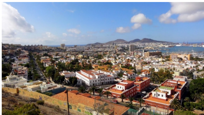
Partial view of the city - from Ciudad Jardín

Primary and Secondary Schools in San Lorenzo, free of charge on the school buses. There are several pickup points in the city. However on occasion there might be the need to make your own way from school (after parent meetings etc). Teachers in the Infant School in Las Palmas and the South school must find their own way to school but this does not usually present a problem.