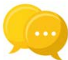
Social and Wellbeing Activities

We recognise that our staff are our most valuable resource and looking after them is the best way to benefit our students. We are committed to looking after your wellbeing and supporting your work. We know how hard our staff work to deliver exceptional results, so we make sure we recognise their achievements and support their wellness. The trust has a range of measures to support staff and their wellbeing, such as: