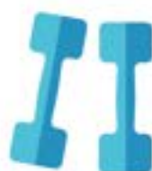
Free use of on-site gyms (Hathershaw & OSFC)