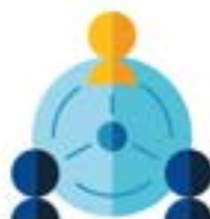
On-site access to the HR Team