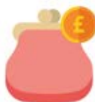
Nationally agreed pay scales, terms and conditions