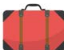
Competitive holiday entitlement for support staff