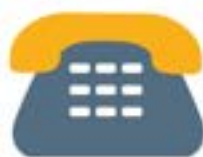
Employee Assistance Programme