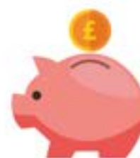
Pension schemes with generous employer contributions