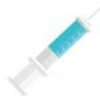
Free flu vaccinations