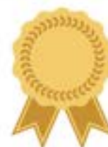
Long service awards at 15 and 25 years